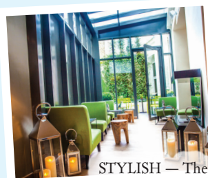
STYLISH — The lobby of the Legend Hotel and a bedroom

GETTING THERE: There is a shuttle bus to Montparnasse Station, about a five minute walk from the hotel, direct from Charles de Gaulle airport. Log on to http://en.lescarsairfrance.com