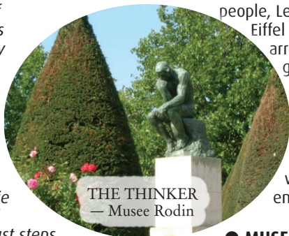
THE THINKER — Musee Rodin

● PANTHEON — This giant mausoleum with its massive portico of Corinthian